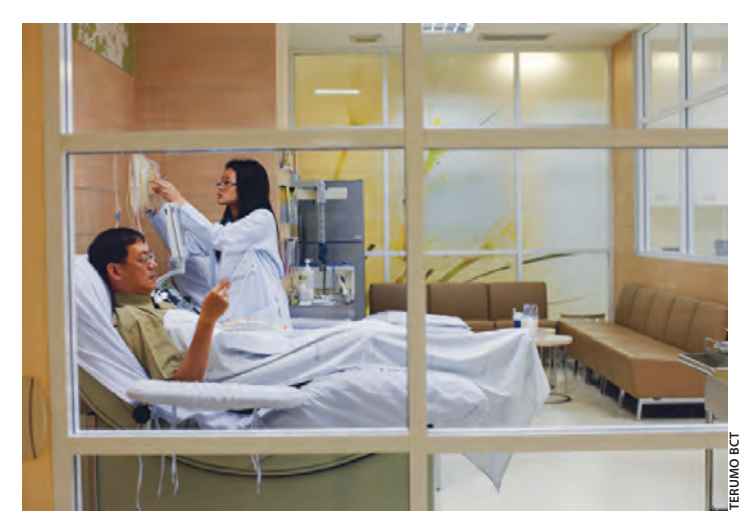
Terumo BCT uses its extensive expertise to develop a wide range of lifesaving treatments and therapies.

From lifesaving blood transfusions to next-generation therapies, Terumo BCT capitalizes on its knowledge of blood and cells as essential components to develop an extensive range of treatments. Its