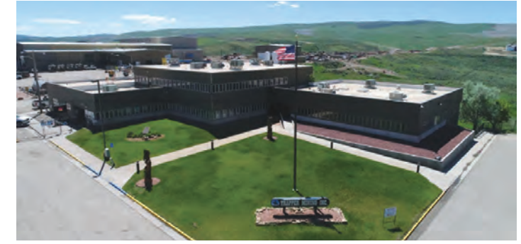
Trapper Industrial Park is a fully independent location on a 4,532-hectare site with over 7,897 square meters of modern office and industrial space with dedicated utilities, explosion-permitting and uncontrolled airspace.

Topping the city's many assets is its people. More than 20% of its working population are college or post-graduate degree holders, and