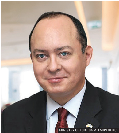
Bogdan Aurescu, Minister of Foreign Affairs of Romania

The most recent document steering our relationship is the 2013 Joint Statement for a Renewed Partnership between Romania and Japan, signed by His Excellency Prime Minister Fumio Kishida, in his capacity as minister for foreign affairs at that time. The eight years that have passed since that moment have proven the closeness and compatibility of our approaches: Romania and Japan work in harmony, have similar positions on most regional and global issues and support and complement each other in various areas. In this vein, we have recently decided to advance our bi-