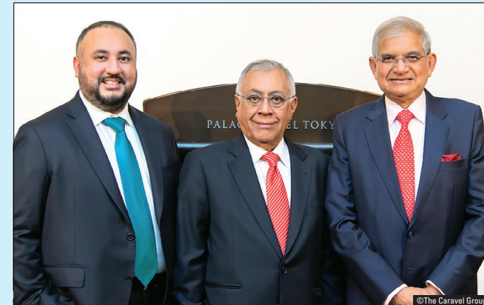
The Caravel Group management team

Rajvanshy: Japan was one of the first markets to welcome us with open arms, and 25 years later it has grown to become our largest market for ship owners. We take great pride in the strong reputation we have built with this community of top