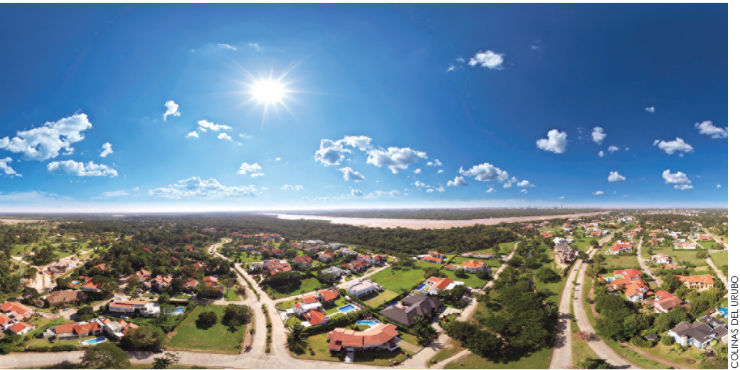
An aerial view of Colinas del Urubo in Santa Cruz