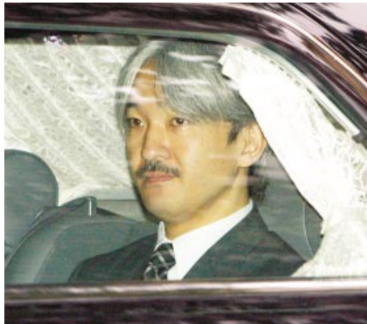
PRINCE AKISHINO (above) enters Aiiku Hospital in Minato Ward, Tokyo, on Wednesday morning to wait for Princess Kiko (left) to deliver their third child.