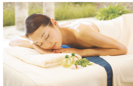
Top: The Hoshinoya Taketomi Island hotel's guest pavilion reflects the traditional architecture found on the island. Bottom left and right: The tatami room and spa offers complete relaxation.

ple, with king-sized futons available upon request. Soft tatami covers its interior, while a sheet of white sand blankets the garden, reflecting gentle light into the pavilion. The hotel's restaurant features top-quality French cuisine using the island's