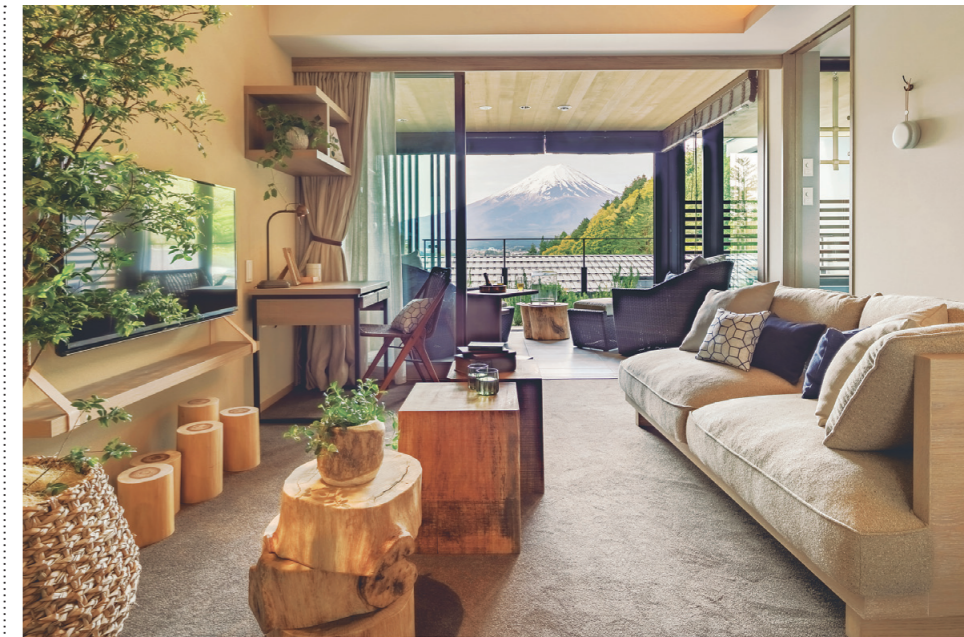
Above: The Fufu Kawaguchiko hotel, against a backdrop of Mount Fuji and located in the beautiful area of Lake Kawaguchi, will open on Oct. 1. The new, petit luxury hotel's design dissolves the boundaries between the cozy indoors and rich nature. Right: All 32 rooms of the hotel are suites, where guests can find relaxation in comforting tranquility.

Fuji spring water, berries, herbs, Koshu beef and pork and vegetables, all nurtured in the crisp, fine air, are used. Superb wines from Koshu and famous