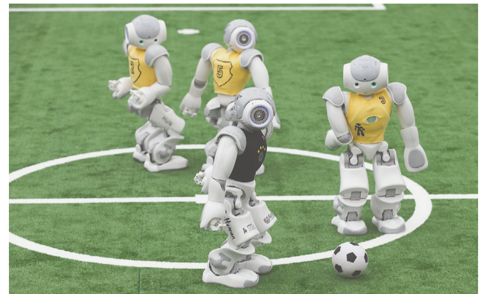
Far left: Nagoya is recently attracting attention as a hot spot and place to be among increasing numbers of visitors for its many trendy places and activities. Left, above: The Robot Soccer World Cup will take place at RoboCup 2017 Nagoya in July. NAGOYA CONVENTION & VISITORS BUREAU, CITY OF NAGOYA