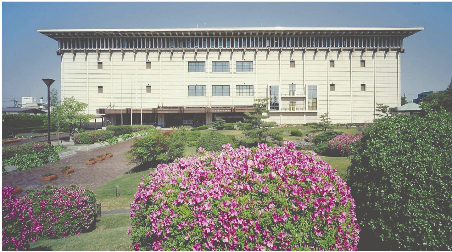
Lectures and workshops are offered throughout the year at the Nagoya City Museum, which has a collection of items related to the history of Nagoya-Owari.

In line with such a concept, it opened the "Zoseum," one of Japan's largest Asian elephant areas, in 2013, as well as the "African Forest Area," where visitors can observe gorillas and chimpanzees in the "wild."