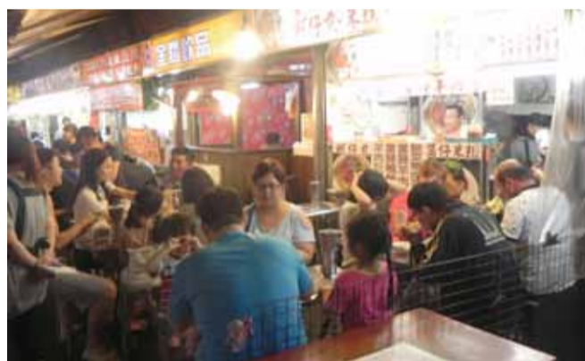
The Luodong Night Market is always busy. RIN ONOZUKA