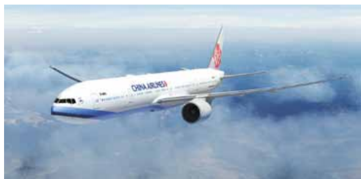
One of the various aircrafts by China Airlines CHINA AIRLINES

Japanese-style architecture can still be seen in Yilan today. The Memorial Hall of Founding of Yilan Administration is a wooden house built in traditional Japanese style in 1906. The house was the residence of Japanese government officials during Japanese colonial rule. Showcasing the city's his-