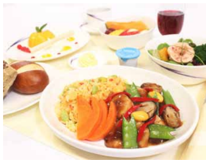
Clockwise from above: Business class meal featuring Taiwan's delicacies by next generation Taiwanese star chefs; China Airlines introduces newly designed uniforms from August. Business-class seat pitch has been extended to 160 centimeters for greater comfort and shell seats recline up to 166 degrees. CHINA AIRLINES