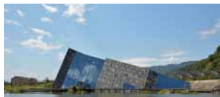
From left: Lanyang Museum; Yilan is surrounded by lush green mountains; A castle-like minsu by a rice field; The Memorial Hall of Founding of Yilan Administration is a wooden house built in traditional Japanese style.